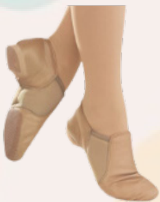
Tan Jazz Shoes