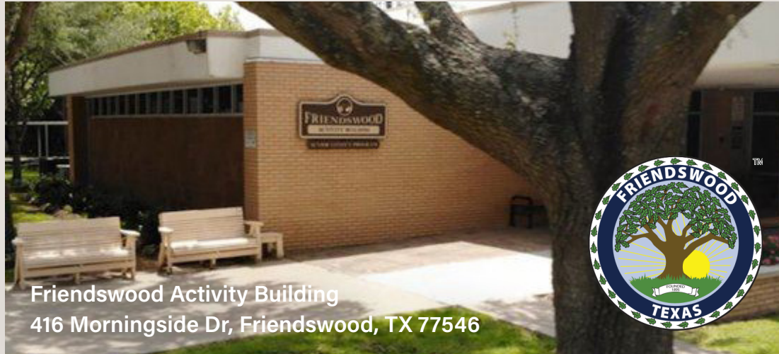
Friendswood Activity Building

To better serve our students, we will be holding classes at the Friendswood Activity Building a short distance from the studio! Select children's and graded level classes will be held here on Tuesdays and Thursdays with the same excellent instruction, strategic teacher to student ratio, and friendly Customer Care Team service that is offered at our main location.