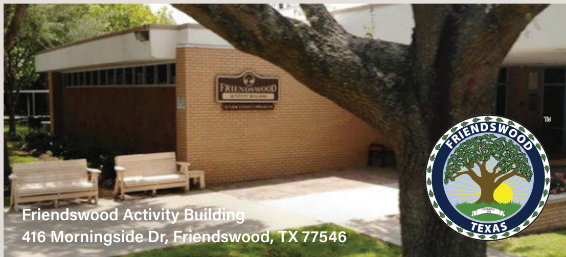
Friendswood Activity Building

To better serve our students, we will be holding classes at the Friendswood Activity Building a short distance from the studio! Select children's and graded level classes will be held here on Tuesdays and Thursdays with the same excellent instruction, strategic teacher to student ratio, and friendly Customer Care Team service that is offered at our main location.